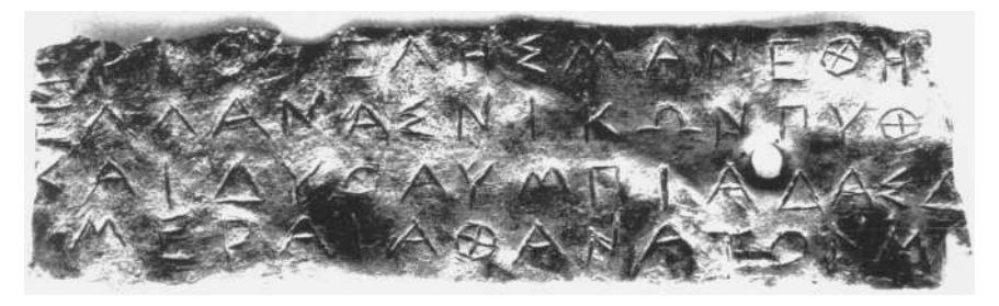
Fig. 6.1a. Inscription on the statue base of Ergoteles.