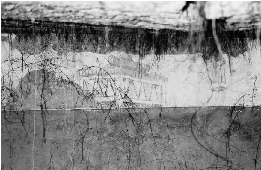
Fig. 6: Agios Athanassios, detail of the papyri on top of a box