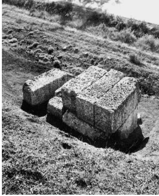
Fig. 1: Derveni Tomb A, the slabs covering the tomb on which whatever remained of the pyre was strewn, among them PDerveni (after Themelis and Touratsoglou 1997, 28 fig. 5)

deceased's second pair of greaves? The deceased buried with the epistomia needed the texts with them inside the grave, on or inside the mouth, on the chest, in their hands. The deceased of Tomb A did not have such a need; or rather, such a need, if there were one, is not attested in the archaeological record, because the evidence did not survive. Consequently, the scenarios pro and con for associating the text on the papyrus and the funerary ritual for the deceased are far from being conclusive.