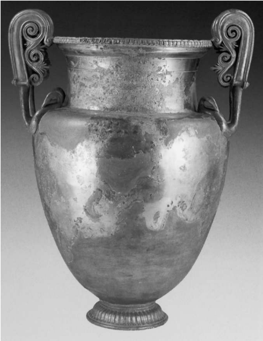
Fig. 3: Derveni Tomb A, the bronze krater inside which the remains of the deceased were laid (after Themelis and Touratsoglou 1997, pl. 1 A1)