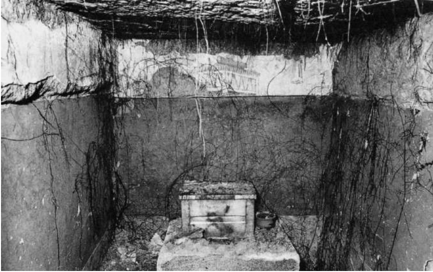
Fig. 5: Agios Athanassios, the interior of the tomb with the silver-plated larnax in the forefront and on the opposite wall the papyri on top of a box (after Tsimbidou-Avloniti 2000, 568 fig. 2)