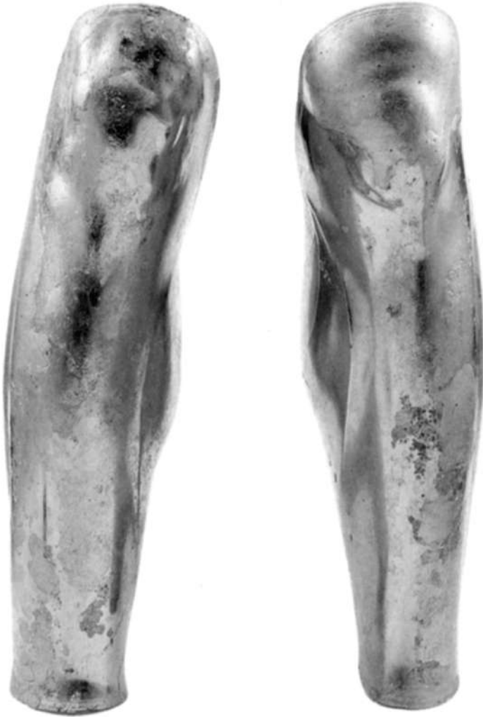
Fig. 4: Derveni Tomb A, the second pair of bronze greaves found inside the tomb (after Themelis and Touratsoglou 1997, pl. 7 A15)